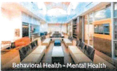
Behavioral Health - Mental Health